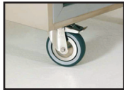
Front locking casters, to keep unit in place.